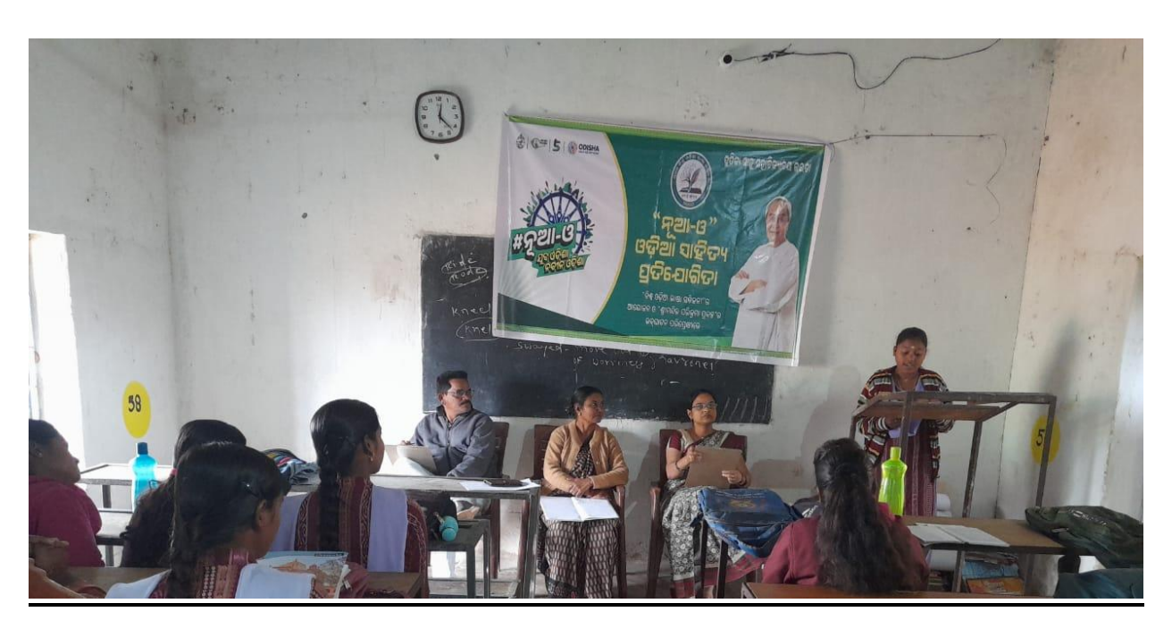
TOPIC - <u>ଶ୍ରୀ</u> ଜଗନ୍ନାଥ ସଂସ୍କୃତି