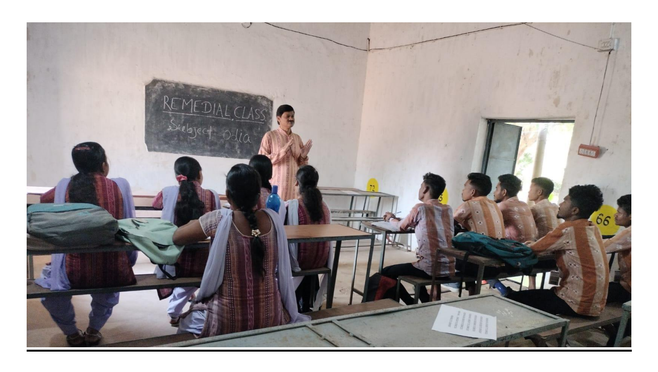
REMEDIAL CLASSES BY DIFFERENT DEPARTMENTS OF ARTS AND SCIENCE